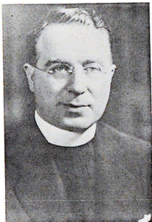
FR. CHARLES E. COUGHLIN

ing the entire proposition, the executive committee unanimously decided to make proper financial and other provisions for launching a program against Coughlin, including (1) a huge mass meeting at the Naval Armory; (2) one or more radio broadcasts. It was also decided that the program was to be announced as being sponsored by the Unitarian Fellowship for Social Justice, the idea being that although the financing, the ground work, the publicity, and the entire nature of the program was to be determined by us, it be done in such a manner that the general public could make no direct connection between the Jewish Community Council and the program.